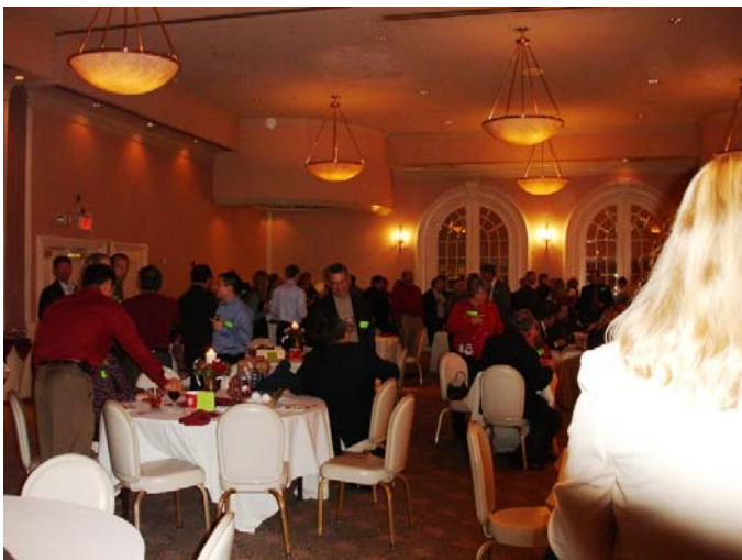
Members of the SAME, PEMA and SMPS socialize at the 2007 Holiday Mixer in Downtown Sacramento.