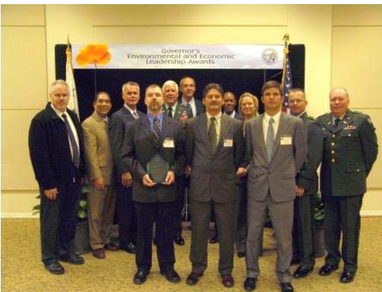
CMD Soldiers and employees, with the Governor's Cabinet Secretaries, receive the GEELA 26 NOV 07