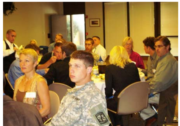
Attendees listen to speakers at the SAME Sacramento Post 2007 Young Members Forum.