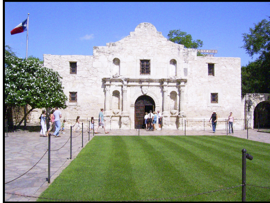
The Alamo, as seen by Sacramento Post Members during the National Conference in San Antonio, TX, May 2004.

How many streamers did your Sacramento Post win this year? ALL NINE! A Grand Slam! Congratulations!