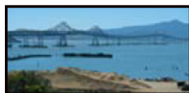
Richmond / San Rafael Bridge, CA

http://www.roberts-gerwick-conference.org