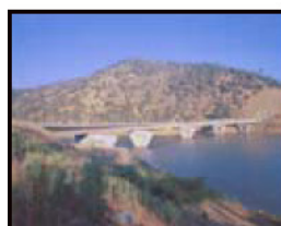
Tuolumne River Bridge, CA