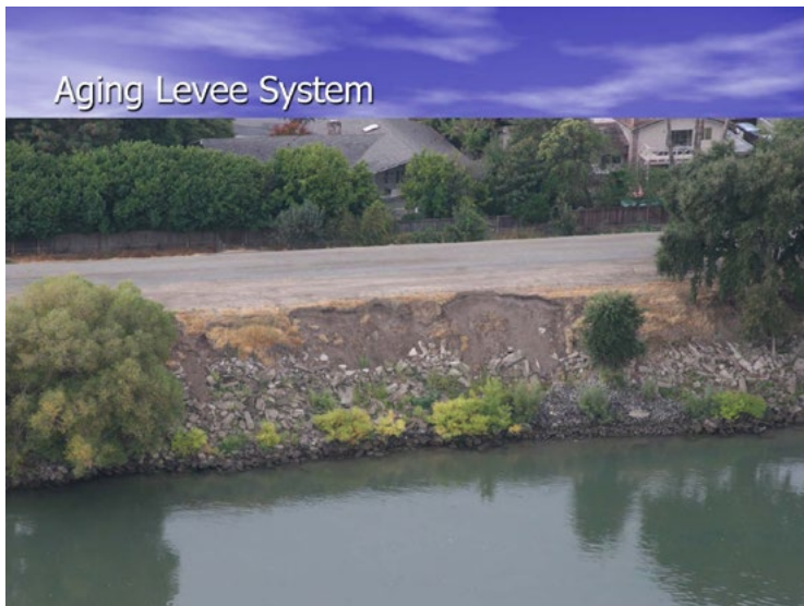
Aging Levee System