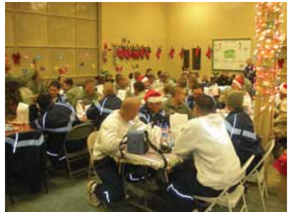
Deployed squadron members sitting down to eat and enjoy their goodie bags as well as the gifts from their stockings.

Every line of the song had a story behind it tied to an entertaining or frustrating or daily occurrence and will continue to have special meaning to me every time I'm reminded of it by hearing the real version of the song. In the end, the holidays are a very difficult time of year for all of our military troops deployed overseas, but the fun we're able to create as a military family combined with the overwhelmingly generous support from loving hearts at home keep us fighting the good fight until we're able to come home ourselves. I would like to say THANK YOU again to all those out there supporting us and MERRY CHRISTMAS!