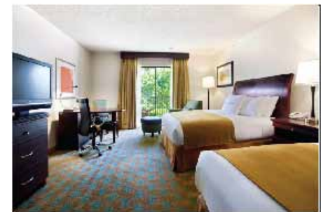
Rooms at the Double Tree Hotel are newly updated, and favorable room rates have been negotiated.

Each year, the conference has grown in size, scope, and attendance. This will be the second time the conference has changed venues to accommodate the growth. The Double Tree Hotel, located at 2001 Point West Way in Sacramento, was selected to provide adequate space for the conference and ensures that all of those wanting to attend will be able to be accommodated. Additionally, conference attendees will have the options to reserve overnight accommodations at the hotel at favorably discounted conference rates. The Double Tree can concurrently provide for a large general session, an exhibit hall, and several breakout rooms. This allows conference planners maximum flexibility to design a diverse agenda.