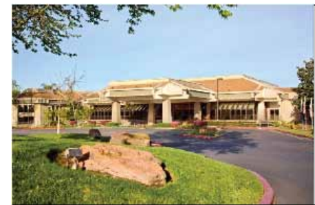
The Double Tree Hotel offers an expansive and attractive venue for the 2011 Water Conference.

The SAME Sacramento Post Board of Directors has approved the Double Tree Hotel as the venue for the 2011 Water Conference. The 2011 conference will mark the third time the SAME Sacramento Post has hosted the popular, bi-annual event for the benefit of its members and sustaining member companies. The 2011 Water Conference will be held October 3rd through the 6th and will provide a thorough update to the complex water issues in Northern California.