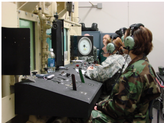
Members of the 9th Physiological Support Squadron monitor Beale Airman inside hyperbaric chamber.