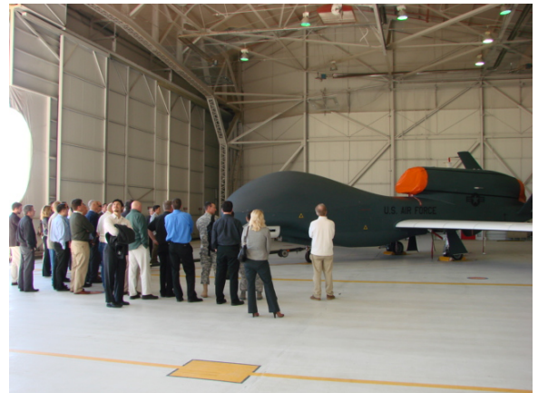
SAME Members touring Beale AFB Global Hawk Facility as part of the February 2008 Meeting.

Next we visited U-2 suit facility and Altitude Chamber Demonstration. The briefing on the U-2 flight suit was very informative and gave a great feeling for what it is like for a pilot in a high altitude flight environment. The team support for Air Force pilots is incredible and flawless.