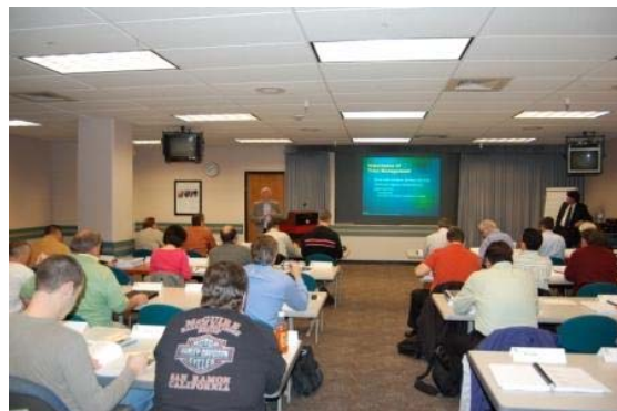
Participants listen to a presentation as part of the CMAA Standards of Practice Course.