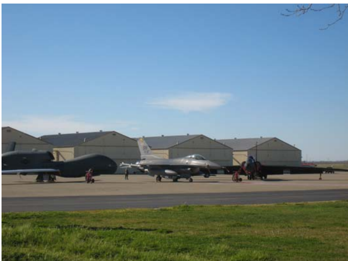
Several of the aircraft SAME Members saw during their tour as part the Post February 2007 General Meeting.

The Two Bay Global Hawk Hanger was nearly complete with crews finishing up the flooring. Being allowed to walk on the tarmac (behind a fence) and seeing aircraft operations was a real treat. The hanger will soon house the newest aircraft at Beale AFB.