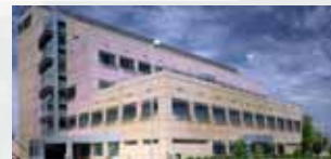
Sacramento VA Hospital

Supported Agencies EPA U.S. Environmental Protection Agency NPS National Park Service DOE Department of Energy DHS Department of Homeland Security VA Department of Veteran's Affairs BOR Bureau of Reclamation BLM Bureau of Land Management