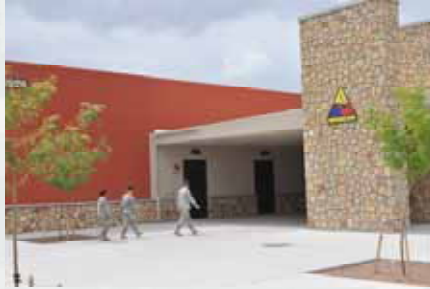
Fort Bliss, TX