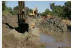
Slurry Wall Construction