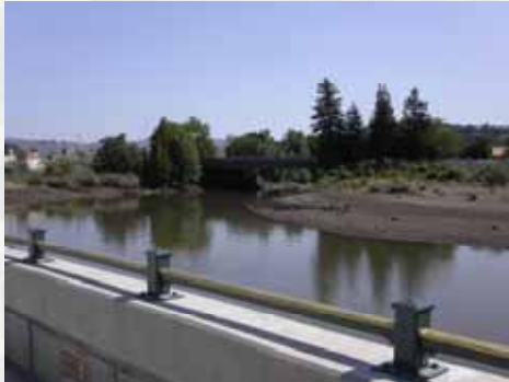
Napa Flood Control Project